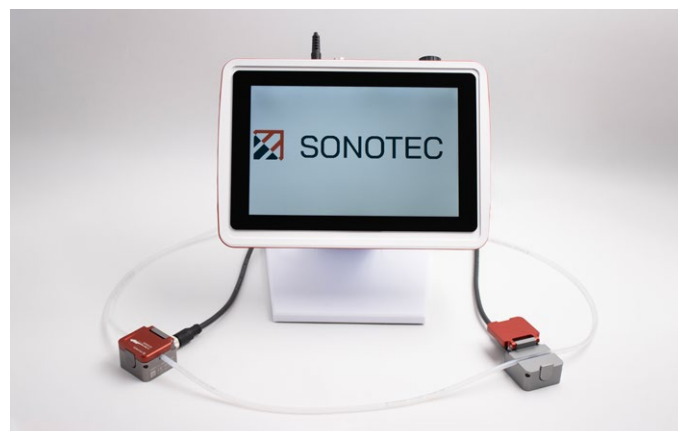
Flotek Controller with two SONOFLOW CO.55 V2.0 flow meters

To address this challenge, ultrasonic flow meters from SONOTEC can be used as a replacement for the scales.