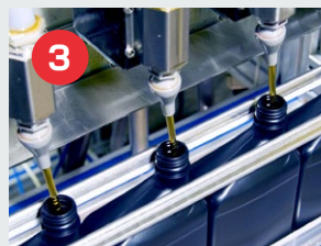
3 System Integration