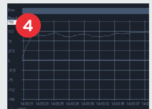
4 Flow Measurement