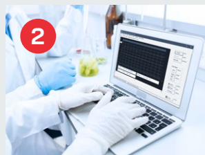
2 Parameter Setting