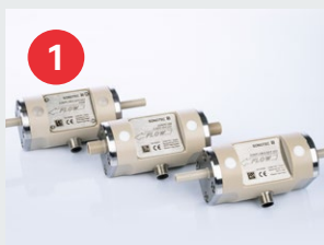
1 Sensor Selection