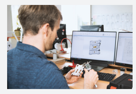
Comprehensive Project Consulting